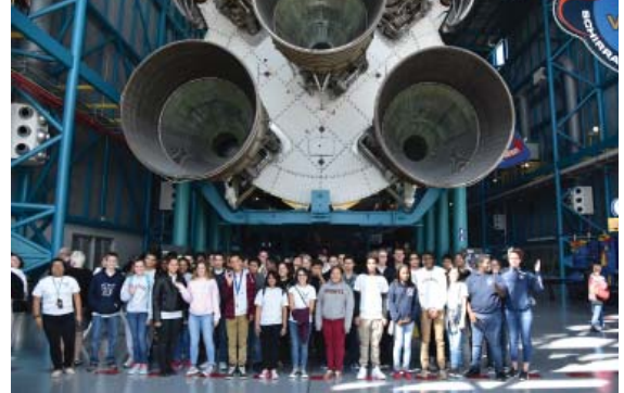
Wekiva High Air Force JROTC cadets and entertain- in front of Space Shuttle at Kennedy Space Center

Recently, fifty Wekiva High Air Force JROTC cadets traveled to Kennedy Space Center for an educational ing field trip.