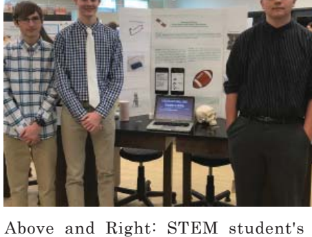
Rico, Dominican presentations at Polk State Chain of Republic, Great Lakes Collegiate High School

ects to faculty, staff, students, college admin-