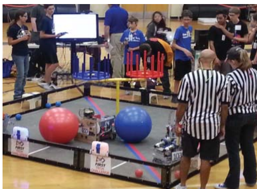
CFC-AFA members judge FIRST robotics meet

Science, technology, engineer- High School STEM Enhancement Verizon App Challenge with a focus ing, and mathematics (STEM) Program. They recently hosted an an- on some key medical science areas: programs continue to make news in nual STEM Research Project Display. conservation of energy, athletic