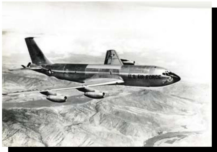
USAF KC-135 aircraft - Originally purchased during the Eisenhower Administration. Many are still flying today!

Regardless of administrative or legal decisions, the first new tanker will not be rolling out until 2015 –