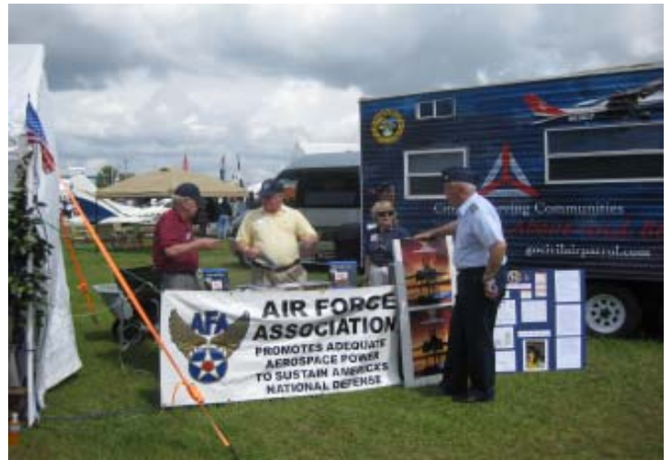
Central Florida Chapter at AFA Information and Membership booth at Sun 'n Fun