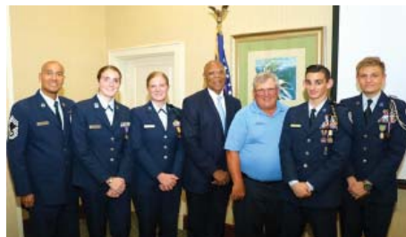
Thanks to Seminole AFJROTC for presenting the Colors

We learned more about the organization charter and various